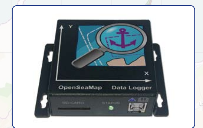
Hardware-logger from OpenSeaMap

http://depth.openseamap.org/order-logger