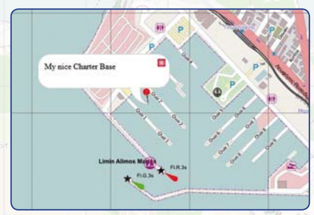
Your advertising on OpenSeaMap

http://openseamap.org/in-websiteeinbinden